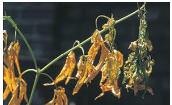
Figure 2: Symptoms of Fusarium wilt of cannabis caused by Fusarium oxysporum f.sp. cannabis 4 .

Symptoms start with small dark irregular spots on lower leaves on plants, followed by sudden chlorosis/discolouring, wilting and upward curling of upper leaves on the infected plant 4 . Some F. oxysporum species can be seed transmitted. Cannabis seed must be sourced from a country which is free from F. oxysporum f. sp. cannabis or has been treated with an appropriate fungicide or hot water treatment at 50°C for no less than 20 minutes.