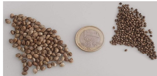
Figure 1: Seed from different Cannabis spp.

In addition to biosecurity import conditions, importers must comply with the requirements of other regulatory agencies, such as the Department of Health, Department of Home Affairs, Therapeutic Goods Administration, state/territory governments.