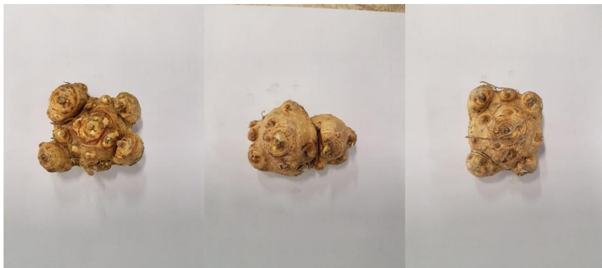
Table 2: Quarantine pests 1 for Zantedeschia dormant tubers from all sources (August 2016)