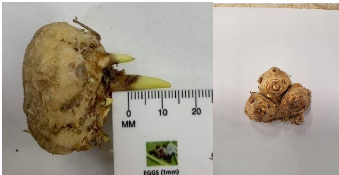
Figure 1: Images of dormant Zantedeschia tubers acceptable for import into Australia.

*Note: If shoots exceed the 20 mm length, the consignment does not comply with the requirements of the Systems Approach.