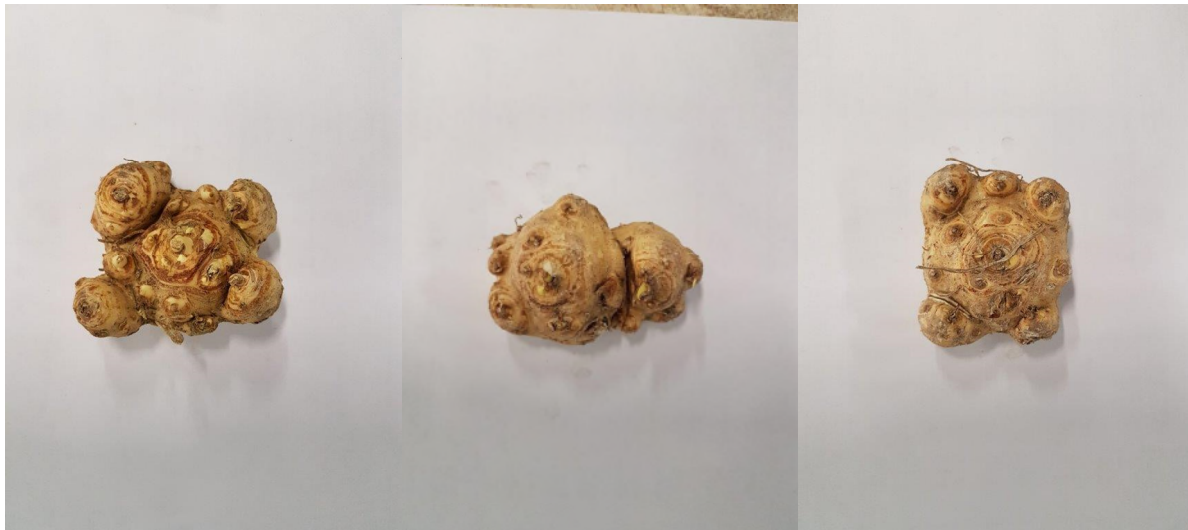
Table 2: Quarantine pests 1 for Zantedeschia dormant tubers from all sources (March 2020)