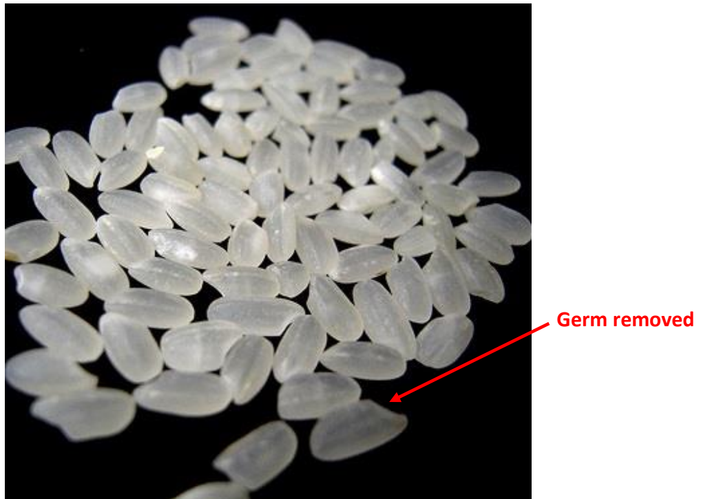
Figure 2: Non-viable rice

Rice that has been sufficiently milled to remove most or all of the germ is not viable and is no longer capable of germination.